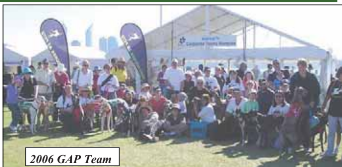
2006 GAP Team

After last year's extraordinary effort to take out the "Biggest Corporate Team" award, start limbering up to defend our title this year!