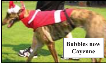
Bubbles now Cayenne