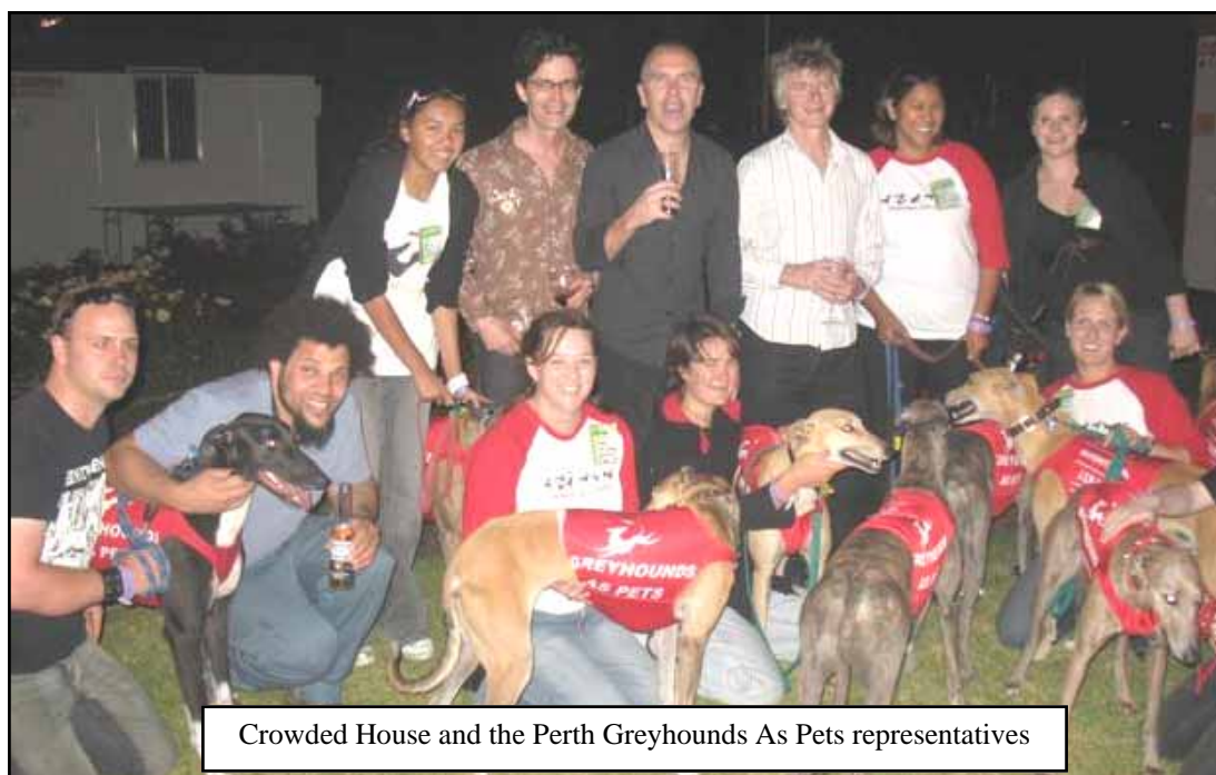
Crowded House and the Perth Greyhounds As Pets representatives